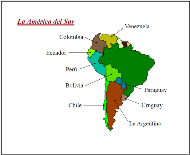
Sep 22-3:15 PM